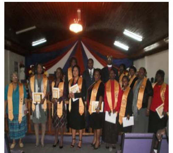
Bahama Islands Conference Life Members