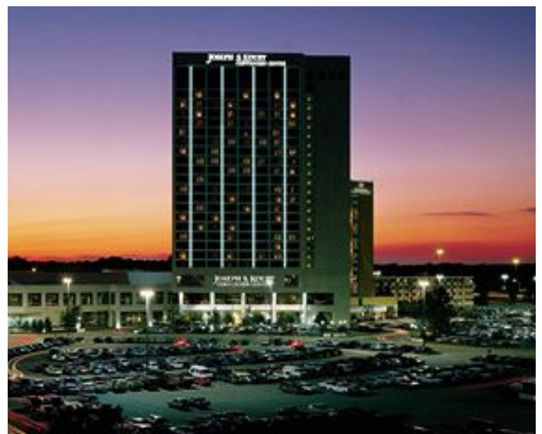
Sheraton Four Seasons Hotel Joseph S. Koury Convention Center, Greensboro, NC