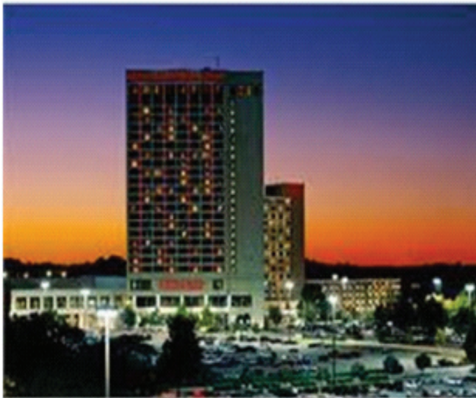
The Joseph S Koury Convention Center Sheraton Greensboro at Four Seasons

The A.M.E. Zion Connectional Lay Council invites you to be a part of the first innovative "CLC Live". This will be held Wednesday evening March 28, 2012 before the Convocation Boot Camp on Thursday morning. Plan to come early, relax and laugh out loud with the Lord. This will be an informal occasion for us to purchase food, have karaoke, participate in, "Name that Bible Verse" contest, and enjoy music and other exciting events. Spread the word! There is no charge for this event.