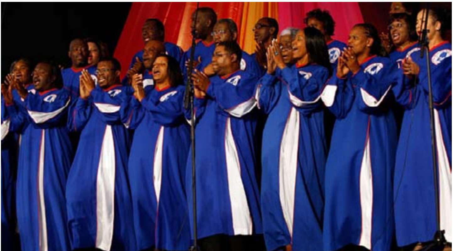
Mississippi Mass Choir - more details to follow